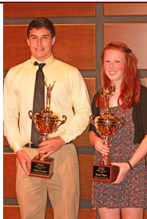
2012 Athletes of the Year